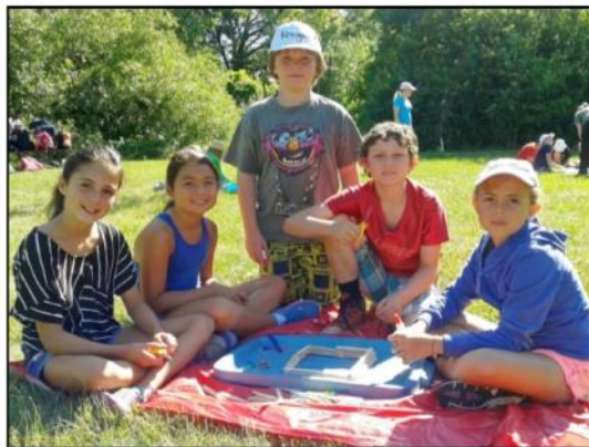
Building lighthouses at Calf Pasture

We offer 4 five-day Summer Camps, Monday to Friday, 8:30 am to 4:30 pm