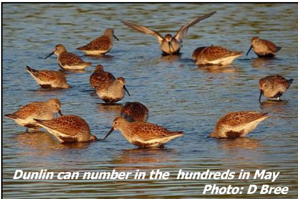
Dunlin can number in the hundreds in May

My parents travelled from Toronto to Brighton in the late 1970s, stayed at the Butler Creek B&B, and passed their days birding in Presqu'ile Park.